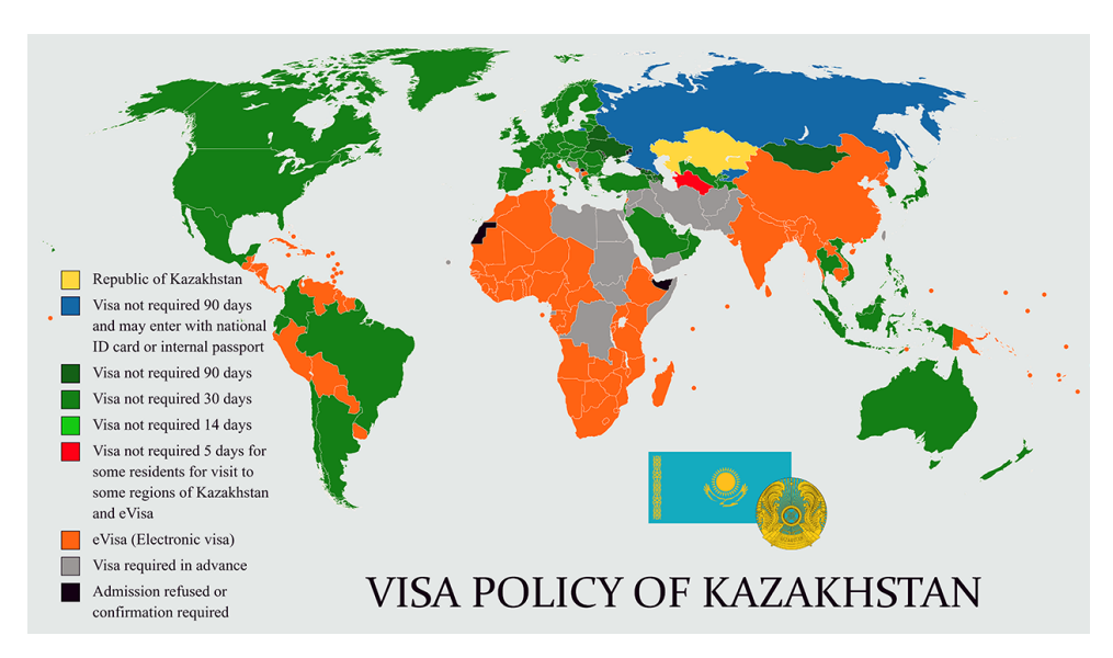
Figure 1: A map of Kazakhstan's visa policy.

To date, Kazakhstan has received 3.7 million international migrants, ranking sixteenth in the world. Based on the strategic vision of the role of migration processes, as well as taking into account both Kazakhstan's experience and international experience in managing migration processes and guided by the objectives of ensuring national interests in conjunction with the development opportunities in various social areas, the Government of Kazakhstan has approved the Concept of Migration Policy of the Republic of Kazakhstan for 2022–2026 (Amerkhanova et al., 2021). The new policy aims to improve the system of ethnic migration management, pay attention to the employment of kandas and their integration into local communities, and more actively work with special support funds to disseminate information about the resettlement program to Kazakhstan in Kazakh communities in various countries. The new migration policy does not imply bureaucratic bans on Kazakhs traveling abroad to work. The policy aims to regulate migration processes more effectively and considers the interests of the state, society, and migrants.